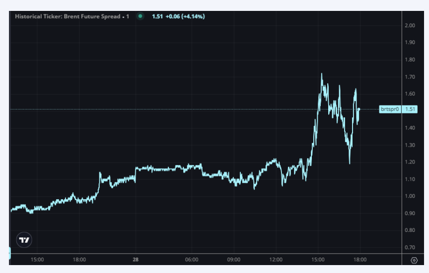
Figure 1: Brent Futures Prompt Spreads (Onyx Flux)

Namibia's oil industry is also showing signs of promise after significant discoveries by Shell, TotalEnergies, and Galp in the Orange sub-basin. Previous exploration failures had deterred interest, but recent discoveries have made the region a new investment hotspot. Galp's discoveries in PEL 83 and Mopane field, potentially holding at least 10 billion barrels, have attracted major companies like Exxon. Namibia's national oil company NAMCOR and Custos hold stakes, with further bids anticipated. Production is expected to start by 2030, positioning Namibia as a potential rival to Guyana in crude reserves.